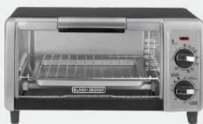
OVEN OR AIR FRYER