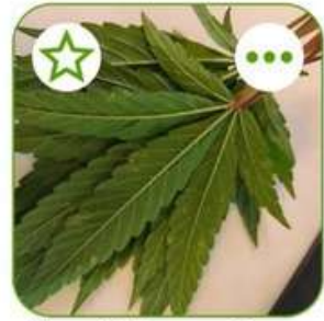
Plant Tissue Can...

Collect cannabis samples ensuring they represent the batch accurately. Handle the samples with gloves to prevent contamination.